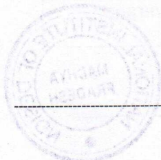
Chief Administrative Officer